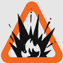
Fire or explosion

Dangerous Incident IncNot0036988 Underground metals mine