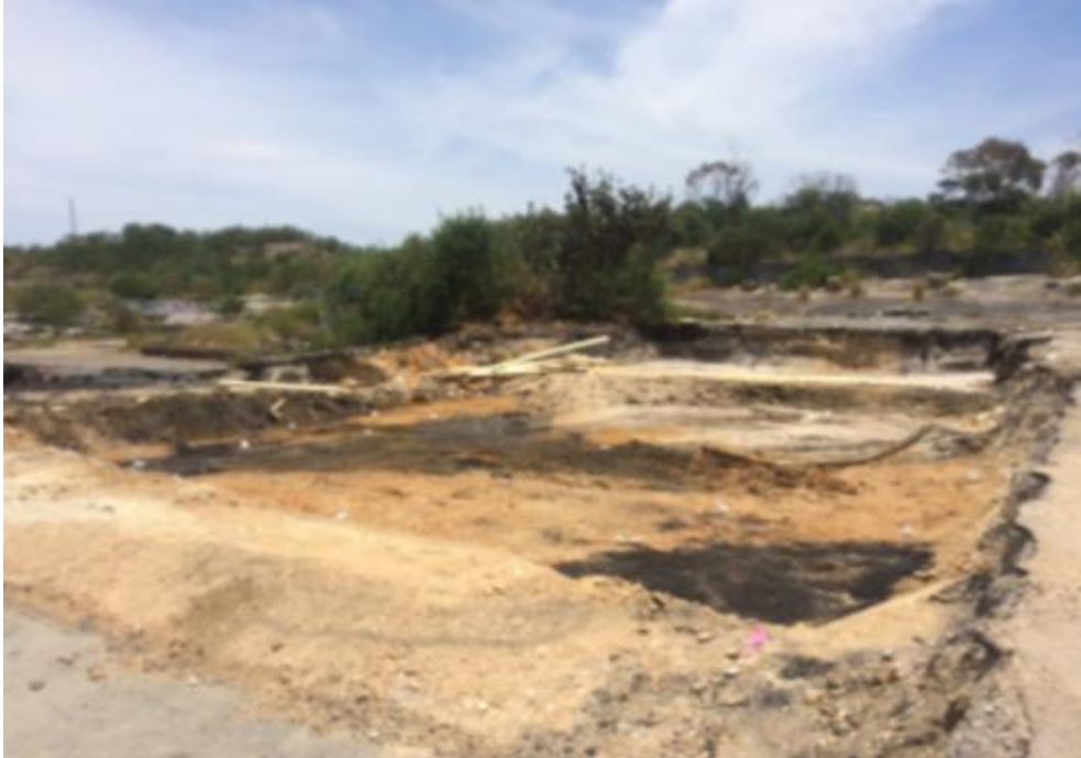
Figure 10: Stockpiling of hydrocarbon contaminated material for bioremediation (2016)