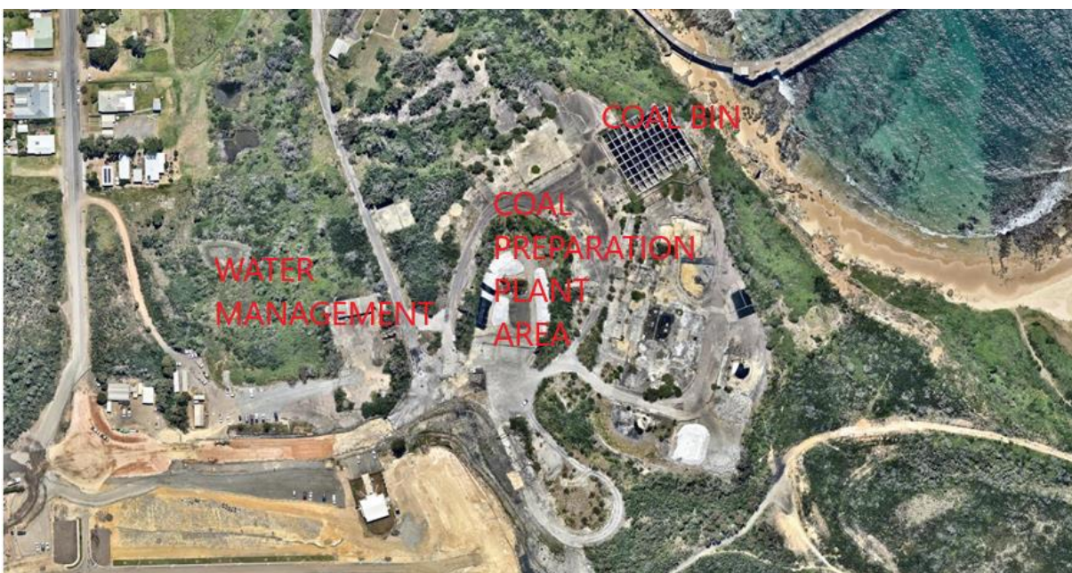
Figure 3: Domains 1A, 2A and 4A in 2016 showing decommissioning of infrastructure, investigation and remediation of areas of contamination including landfarm bioremediation and stockpiling of fill material

Figures 3 to 8 below show the progress of these rehabilitation works, including the backfilling of the coal bin site.