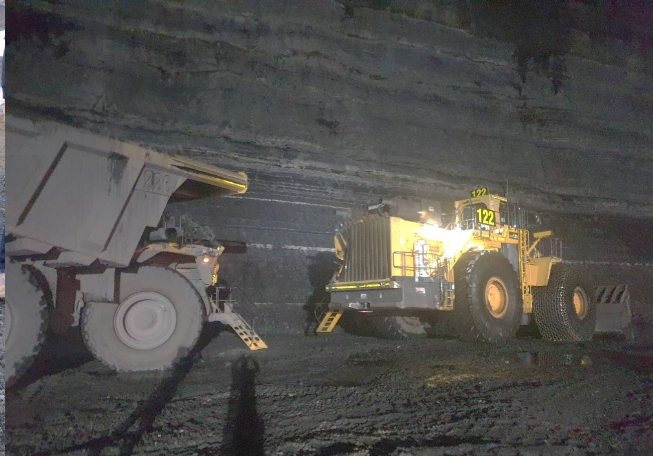
Failure to use positive communication