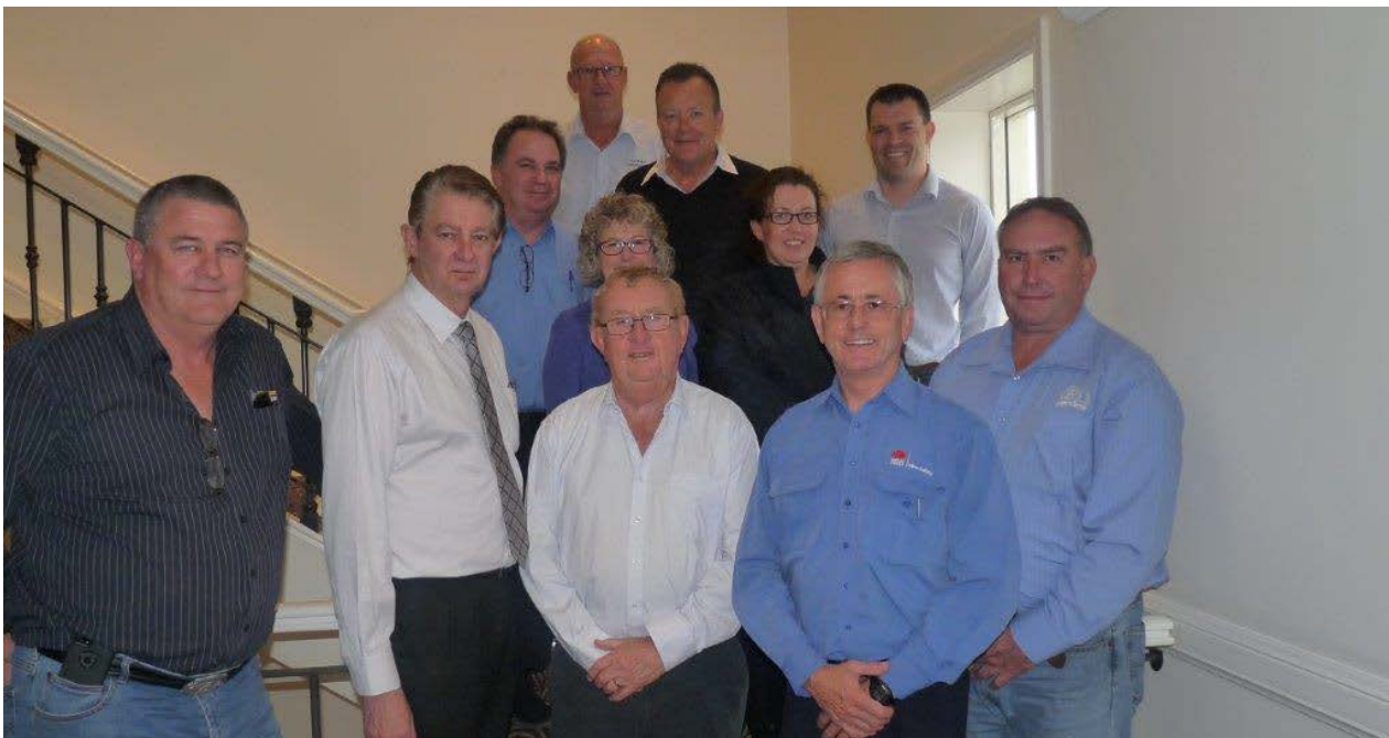
The NSW Mining Competence Board 2014/15 members.