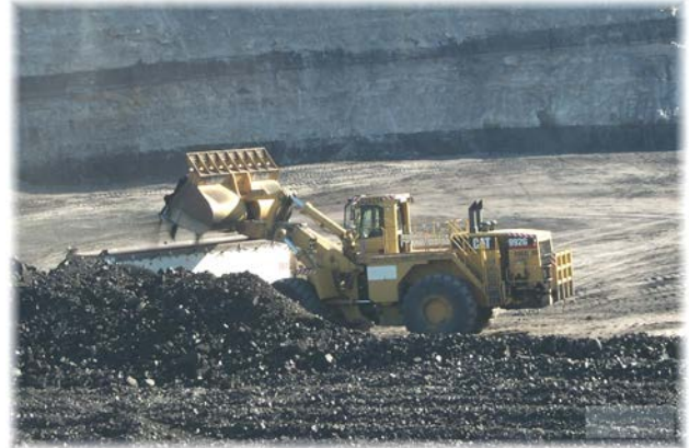
An independent Investigation Unit was formed in response to the unacceptable number of deaths in the NSW mining industry.