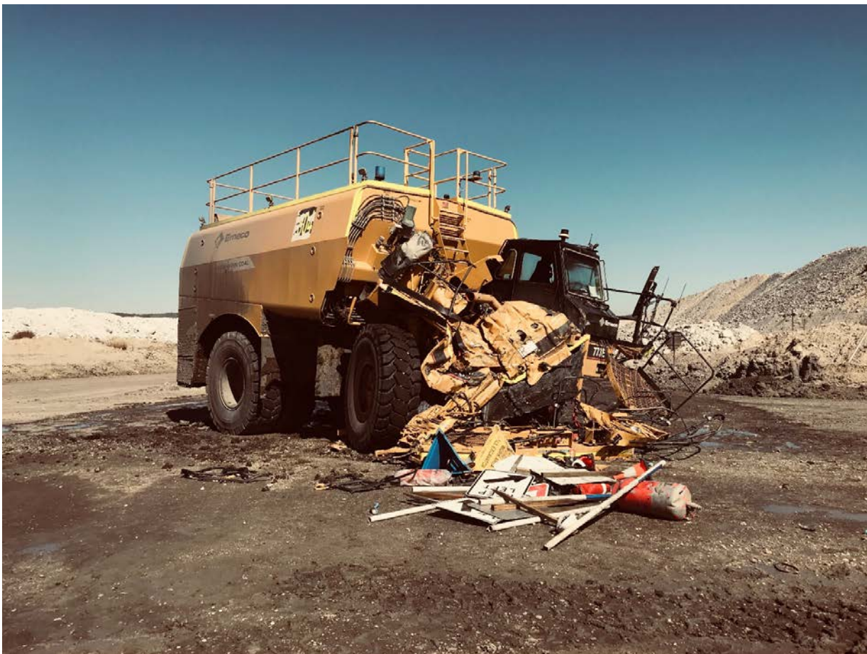
Figure 1 Damaged front end of service truck

On 7 May 2018, the Regulator published an investigation information release about the incident to share early investigation learnings with the mining industry.