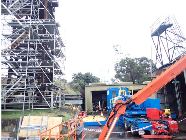
Figure 4 Final location of pulley wheel within taped off, restricted area near drift winder

The NSW Resources Regulator's initial inquiries have indicated that: