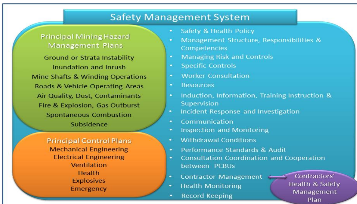
Figure 2: the mine safety management system

Figure 2 below shows the SMS and the relationship of PCPs, PMHMPs and specific control measures.