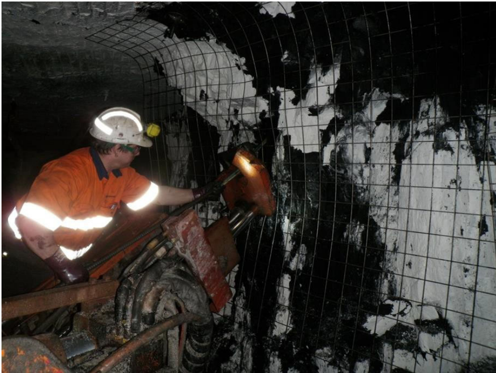
Installation of rib support