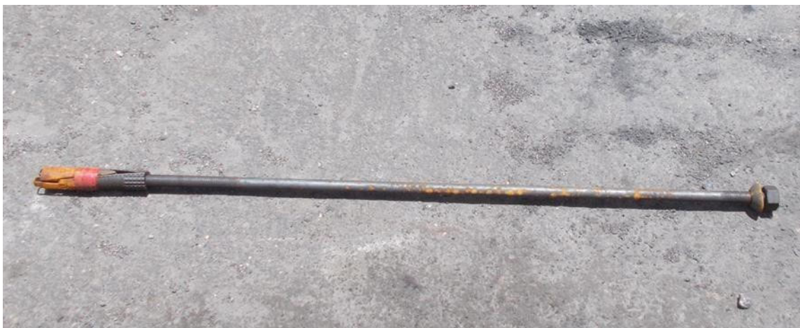
Mechanical Rib Bolt