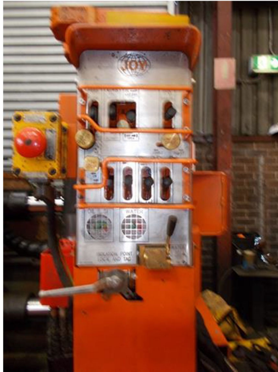
Self Standing Rig Cabinets