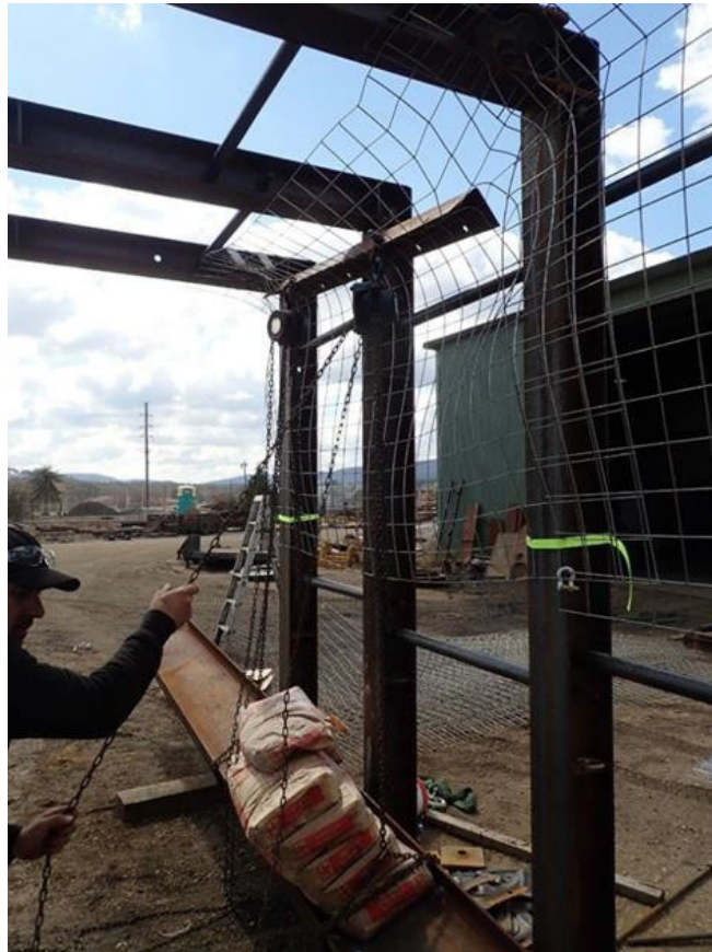
Testing Lightweight Rib Mesh