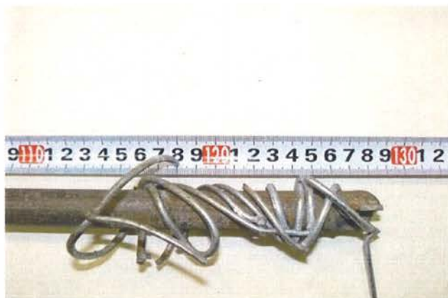
The drill steel, drill bit and entangled rib mesh

A miner suffered serious injuries to his left arm when it became entangled in steel rib mesh and a rotating drill steel. The miner's lower left forearm was later amputated while in hospital.