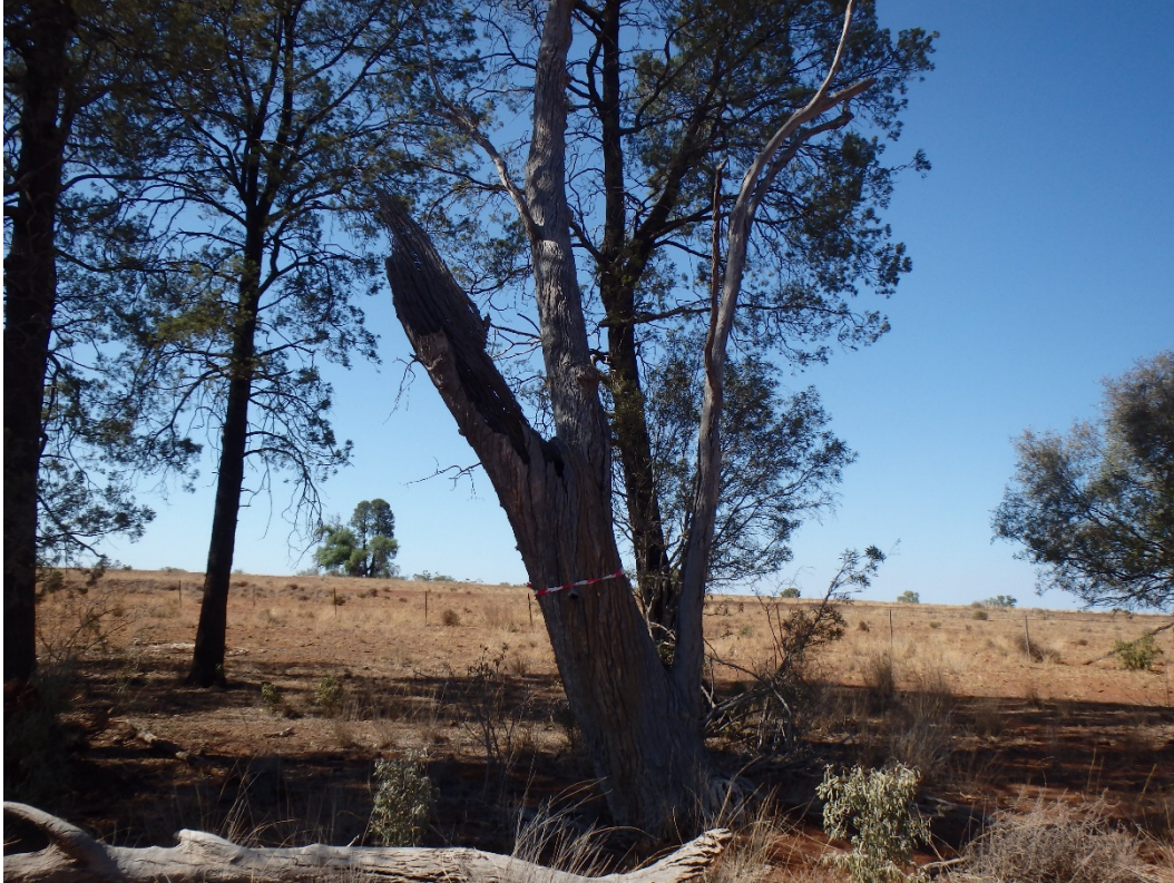
Figure 3 Site NC799 showing marked habitat tree