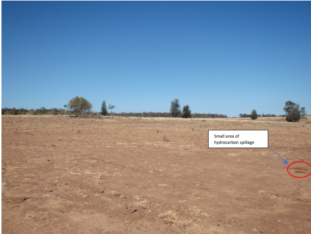
Figure 1 Site NC795 showing rehabilitation and small area of hydrocarbon spillage