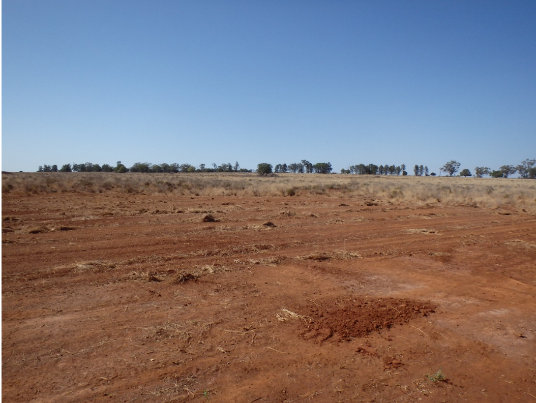
Figure 2 Site NC798 – rehabilitated flat paddock

A review of examples of drill plans provided, with the permits to work, did not show any specific erosion and sediment controls on the plans for any of the sites. No evidence was sighted to indicate that erosion and sediment control plans were prepared for each drill site (or group of drill sites) as part of the site planning process. This is raised as an observation of concern No. 1 .