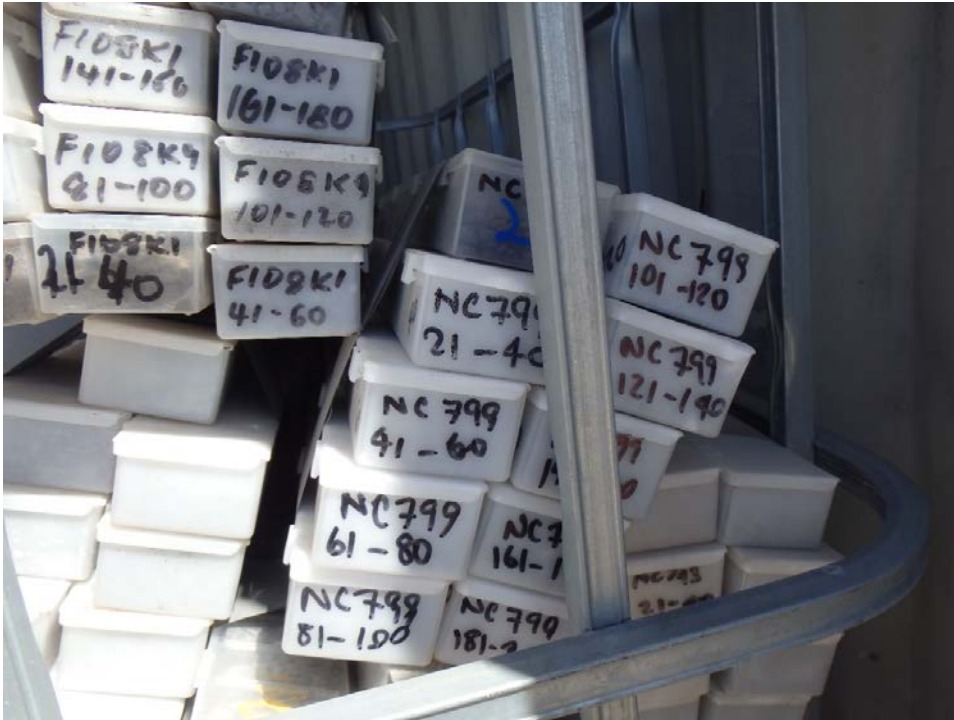
Figure 5 Chip sample trays in a metal framed pod within a shipping container