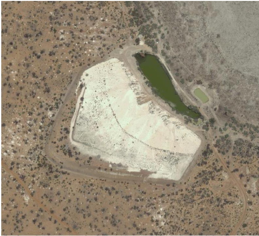
LRMA Tank 4 with 36 available sites for individual members

Division of Resources & Energy | Department of Primary Industries NSW | Department of Primary Industries (Water) NSW | Office of Environment and Heritage NSW | Environment Protection