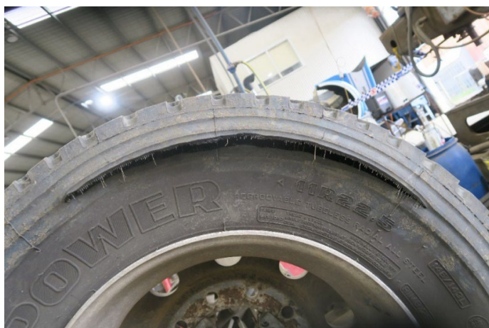
Figure 4: Front view of tyre showing side wall failure

Inspection of the tyre after the incident identified a rupture of its side wall (as shown in Figure 4).