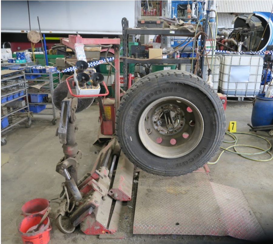
Figure 2: Rear view of tyre and wheel assembly fitted to tyre-fitting machine after the incident