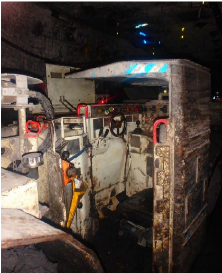
Figure 1: LHD with canopy and access cover open