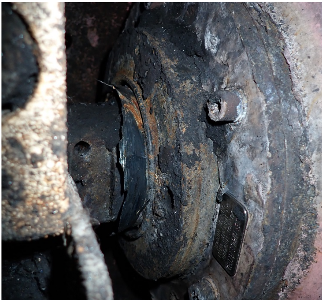
Figure 1: Failed tail pulley bearing

Underground mine workers investigating a burning smell discovered a fire on a longwall conveyor tail pulley. Workers tried unsuccessfully to extinguish 300 mm high flames with water hoses and fire extinguishers while the conveyor was running. The fire reignited when the cool water was removed. The conveyor was stopped, and the fire was extinguished. The conveyor was isolated, water applied to the tail pulley shaft area, and a fire watch was posted pending investigation.