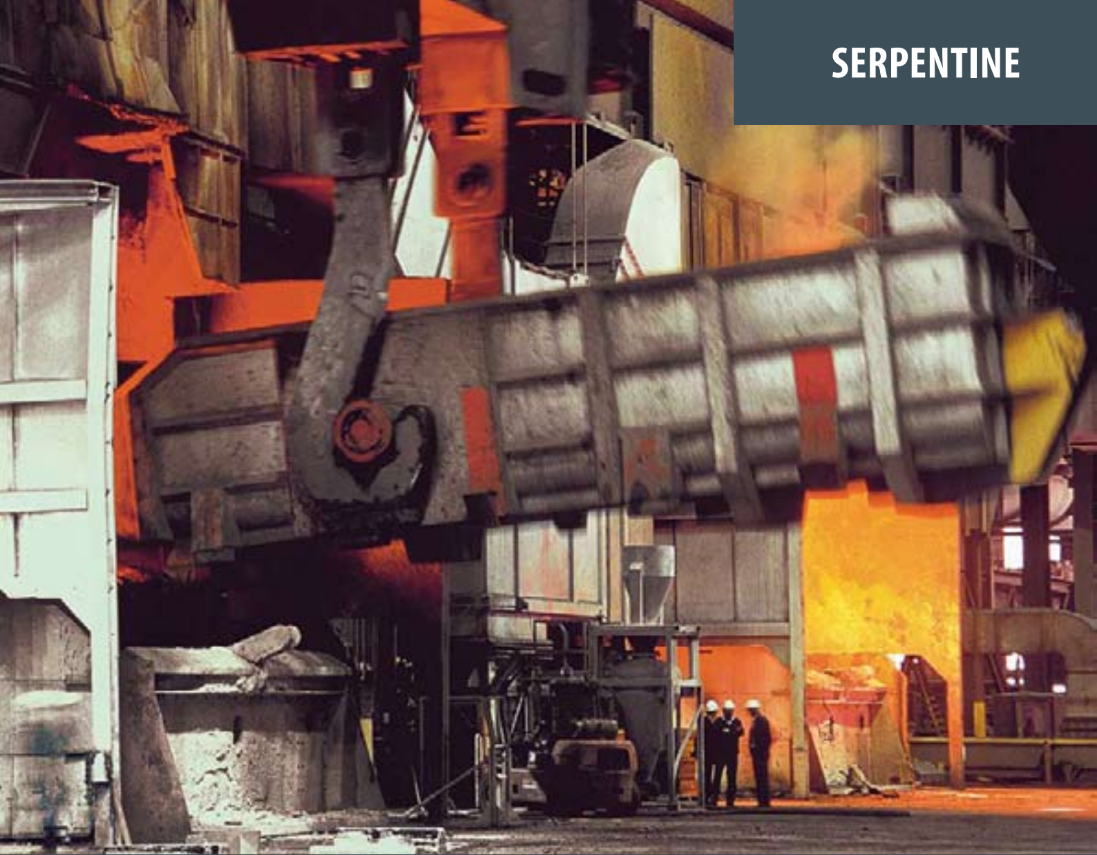
Photograph 20. Port Kembla blast furnace. Serpentine is used as a flux in steelmaking — during which it combines with impurities in the molten metal. The slag can be used for such high-quality uses as skid-resistant road surfacing, concrete aggregate and embankment fill.