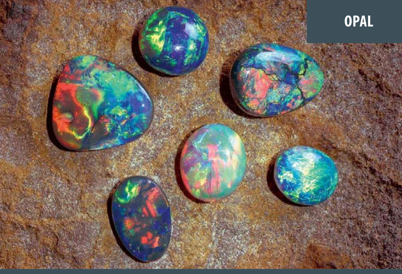
Photograph 17. Black opals from Lightning Ridge (enlarged). New South Wales is the world's principal supplier of high-quality black opal, with the Lightning Ridge field accounting for most of this production, and the White Cliffs field responsible for a lesser proportion.