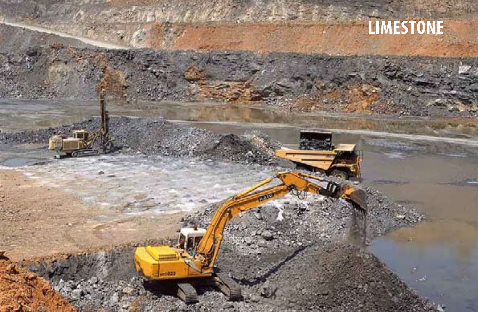
Photograph 10. Kandos limestone quarry, Kandos. Limestone from the Kandos quarry is used in cement manufacture on-site. The ideal grade of limestone for cement manufacture is around 70–80% calcium carbonate. The Kandos plant operates two kilns, producing about 450 000 tonnes of cement each year, which is sold entirely into the New South Wales market.