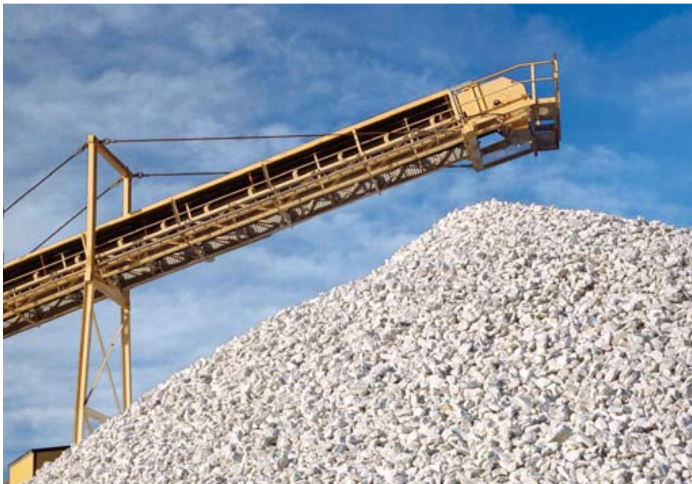
Photograph 11. Limestone stockpile at the Omya Limited processing plant at Bathurst. Omya Southern Pty Ltd mines high-quality limestone at Cow Flat, near Bathurst. The company produces a range of ground calcium carbonate products at the on-site processing plant for use as filler materials and in chemicals.

and limestone-based products are commodities with only medium unit-value.