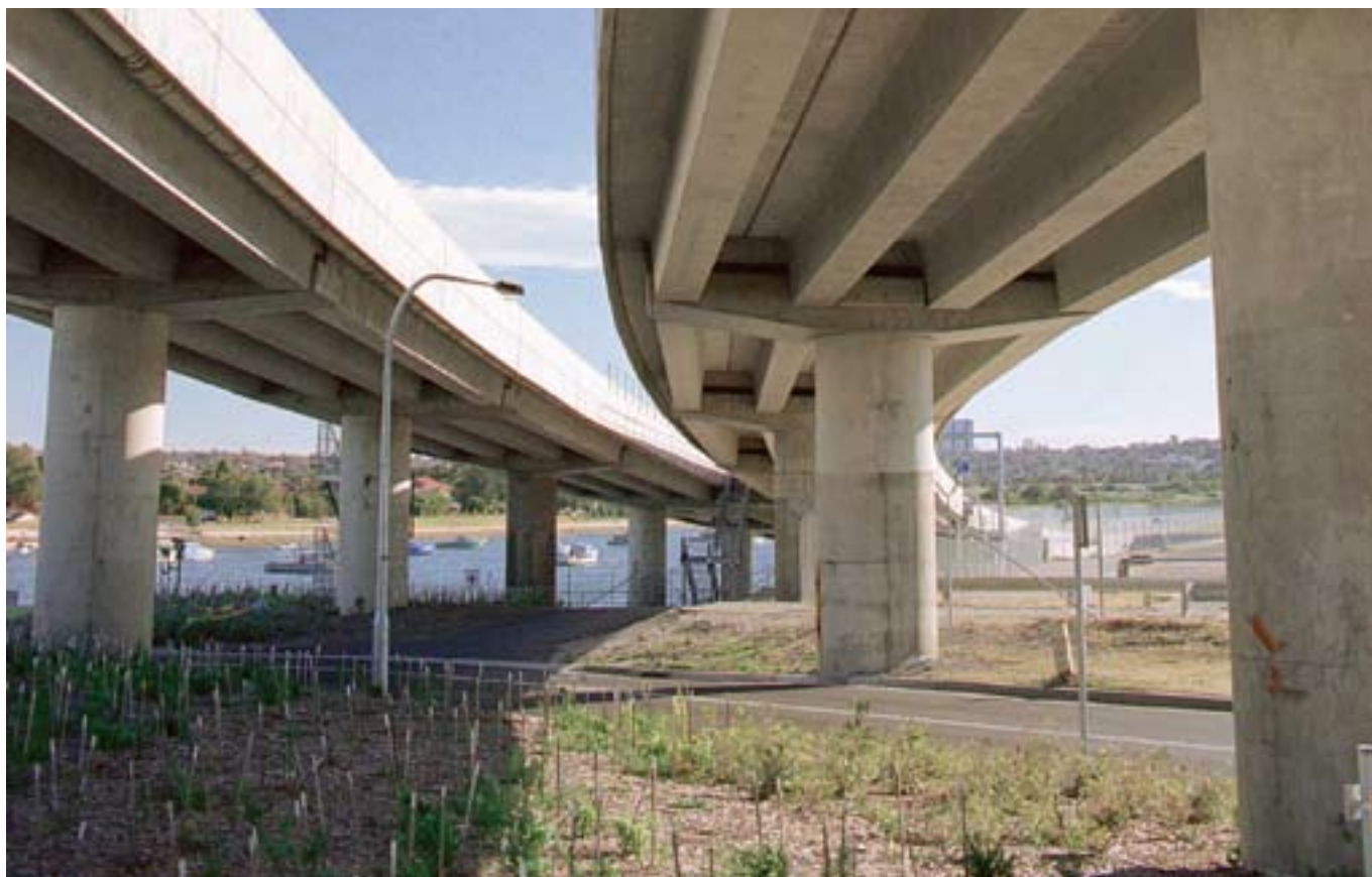
Photograph 12. Limestone is a major raw material used in cement in many construction applications. Apart from cement manufacture, other uses for limestone include manufacture of lime, coarse aggregate, metallurgical flux, filler materials, glassmaking, ceramics and chemicals.

At some stage in the future, populations in regional centres may increase to the point where regional cement plants become economic. Higher purity limestone is mined at several centres for other uses — such as fillers, glass, coating and whiting agents, and agricultural lime. Current production is aimed at the relatively small domestic market. Most plants need to produce both high and lower grade (e.g. ground limestone for agricultural use) products to survive.