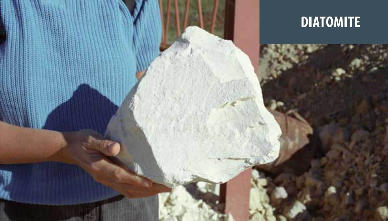
Photograph 5. Diatomite from the Kyooma diatomite mine, Barraba. Diatomite is processed on-site and sold mainly for pet litter and for industrial and agricultural uses. The superior absorbency, chemical inertness and low density of diatomite allow its extensive use in industrial and domestic absorbents.