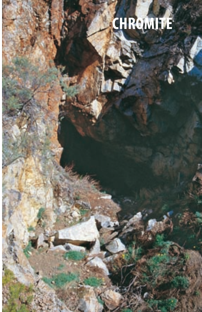
Photograph 3. Part of Quilters East chromite workings, Cootamundra. The deposit is highly variable, intensely fractured podiform chromite within poorly to unfoliated dunite of the Coolac Serpentine Belt. Chromite is the sole commercial source of chromium, which is mostly converted to one of several alloys for use in specialty steels.